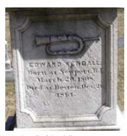
Detail of Kendall gravestone.