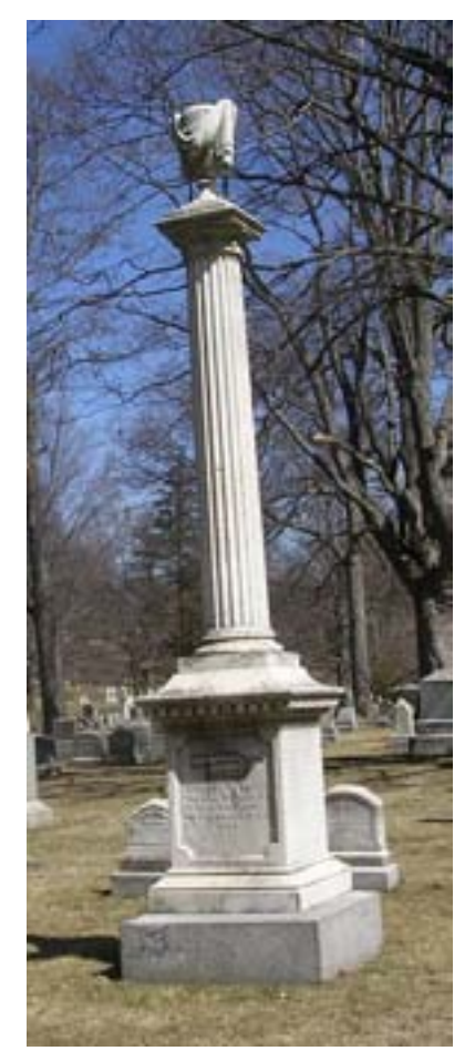
Gravesite of famed keyed bugle soloist Ned Kendall in Boston's Old Forest Cemetery.